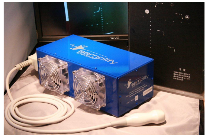
Figure 1: SMK9130 with Probe Connected

Entire system fully enclosed in metal chassis Expandable system to support 256 channels